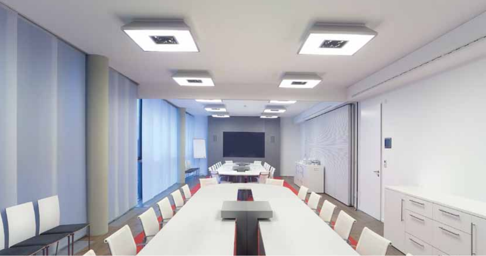
Three out of one: the state-of-the-art "multi-tasking" conference room at the Microsoft office in Cologne, thanks to Nüsing Premium.